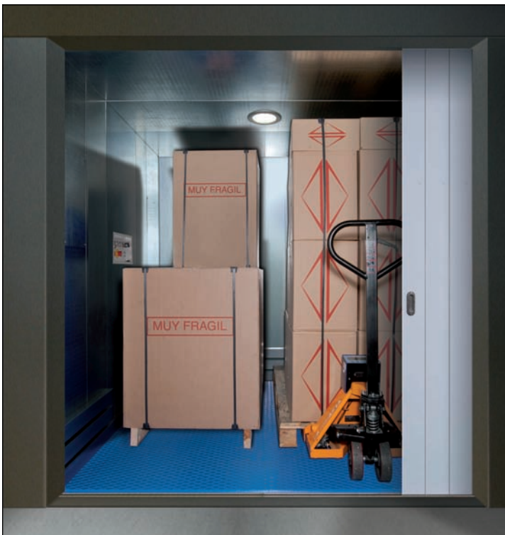
Conventional goods lift mode. The load can take up more space, and the lift is operated from the button displays on the different landings, requiring the presence of an operator on each floor or one moving between landings externally.

The EHmix Lift stands out for its safety features. As is common knowledge, safety is one of the cornerstones of Hidral and its operations. Because of this, it has developed the best safety measures for all of its goods lifts. In the case of the EHmix Lift, the benchmark has been set even higher with the addition of all of the necessary safety features to enable the operator to travel with the goods.