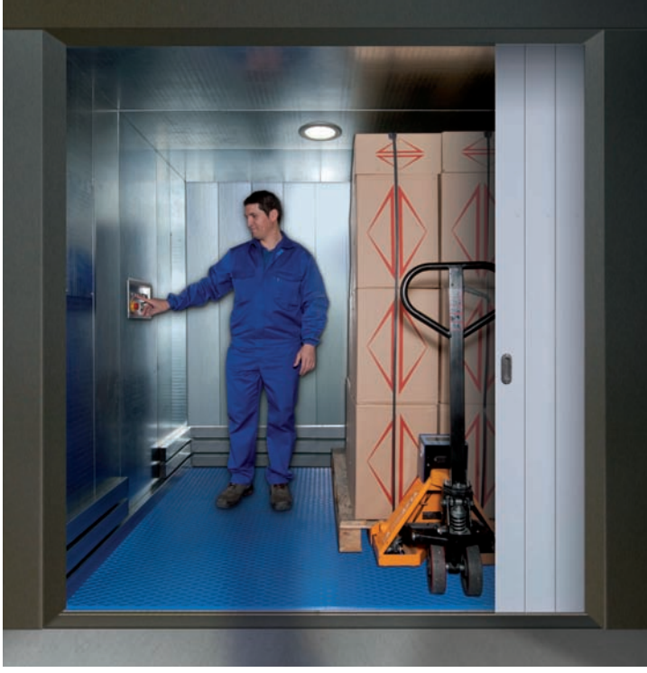
Goods lift with attendant mode. One qualified operator carries out the entire loading-transporting-unloading process and travels in the cabin with the load.